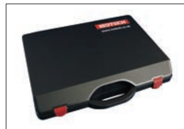
931-22-106 Optional Carrying Case

The TTI-22 includes Cal Notepad software for easy monitoring and logging of data. It is fully compatible with Isotech I-Cal Easy which can automate comparison calibration.