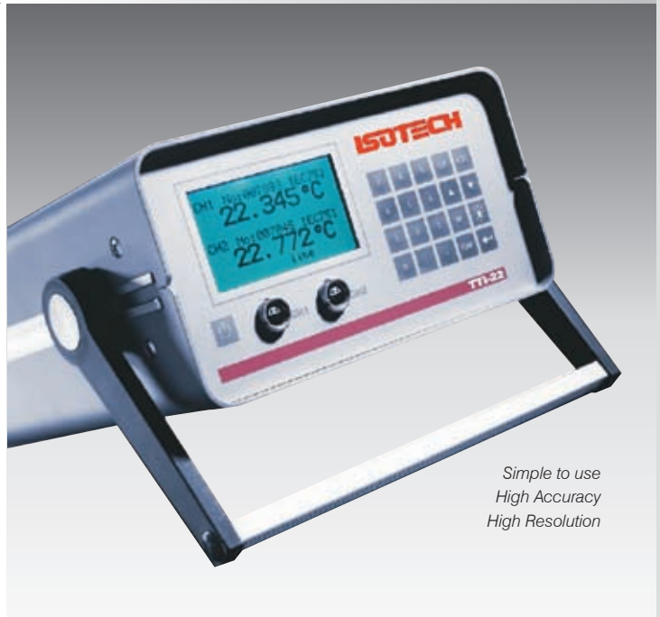
Simple to use High Accuracy High Resolution